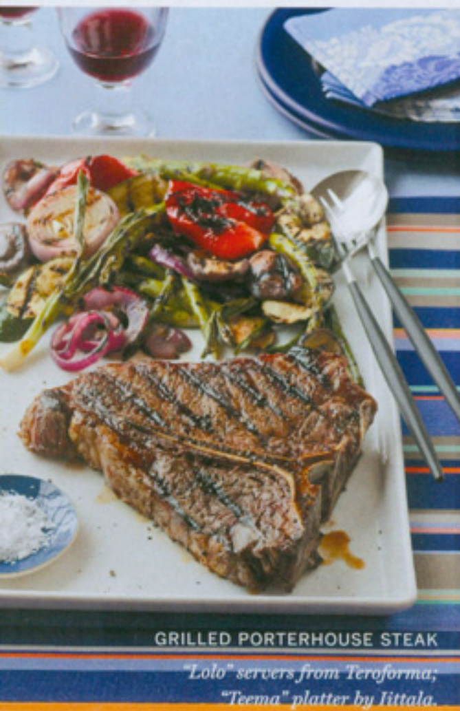
GRILLED PORTERHOUSE STEAK