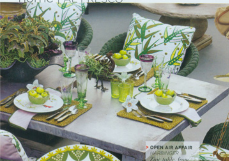
> OPEN AIR AFFAIR HARBINGER Zinc table, from $4,200. Harbinger, L.A., 310-858-6884; harbingerla.com. See Shopping Guide, p.127.