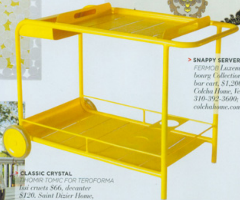
> SNAPPY SERVER FERMOB Luxembourg Collection bar cart, $1,200. Colcha Home, Venice, 310-392-3600; colchahome.com.