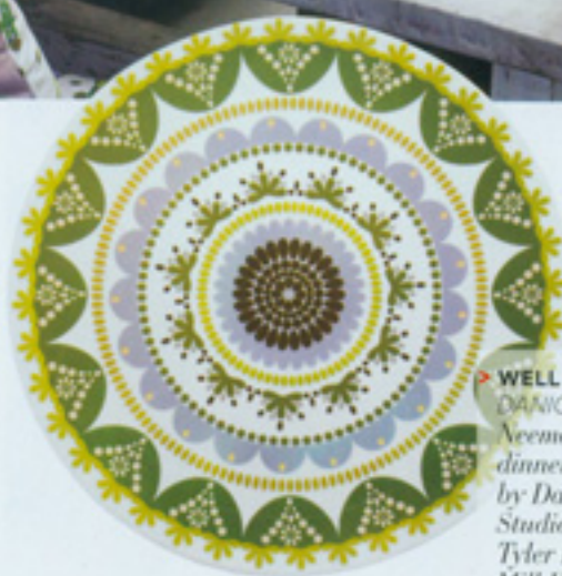
> WELL ROUNDED DANICA STUDIO Neema melamine dinner plate by Danica Studio, $12.95. Tyler Florence, Mill Valley, 415-380-9200; tylerflorence.com.