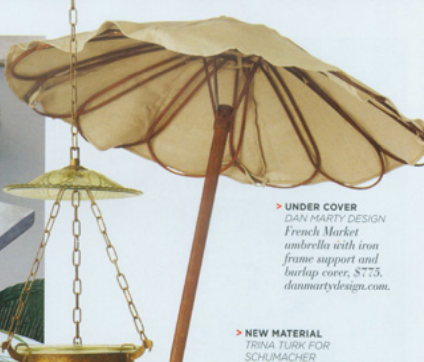
> UNDER COVER DAN MARTY DESIGN French Market umbrella with iron frame support and burlap cover, $775. danmartydesign.com.